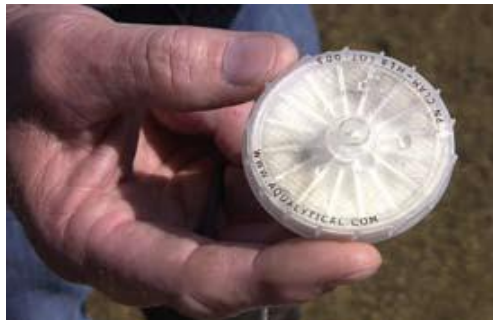
C.L.A.M. disk - that's all that gets sent to the lab, leaving the water behind