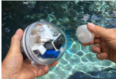
The C.L.A.M. provides a convenient submersible sealed unit with clear visual volume display, external control, and 48 hours of continuous submersible operation.