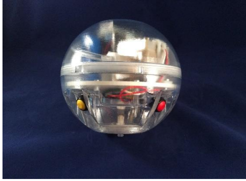
C.L.A.M. - sturdy compact design for ease of use in the field.