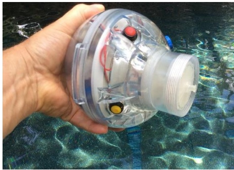
C.L.A.M. with onboard totalizer and external digital display reset and pump control buttons.